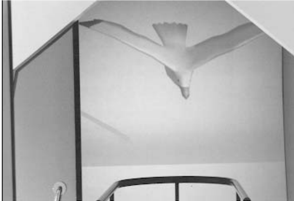
Figure 2. Entrance to the Virtual Portal, Sea Cliff segment.