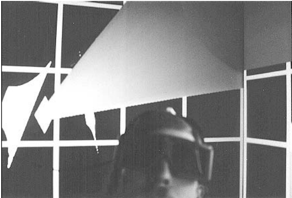
Figure 3. User ducking virtual arrow, Hatchet and Arrow segment.